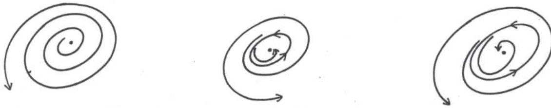
c) A group formation process by the \alpha -limit cycle