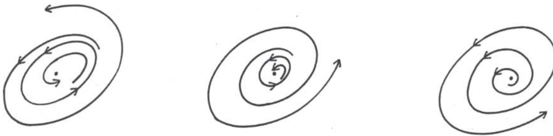
d) A group dissolution process by the \alpha -limit cycle